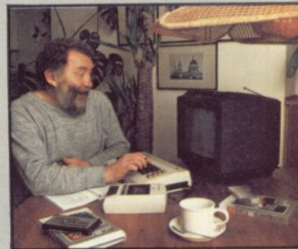
Botanist, T.V. presenter and larger than life character, David Bellamy gets to grips with some of the VIC-20's larger than life characters on his T.V. screen.

Commodore produces a super expander hi-res cartridge to help improve the graph-